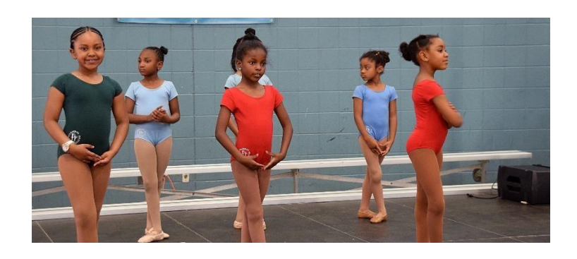
Rahway Day – Saturday, October 19, 2024, 11am – 3pm Participation Form